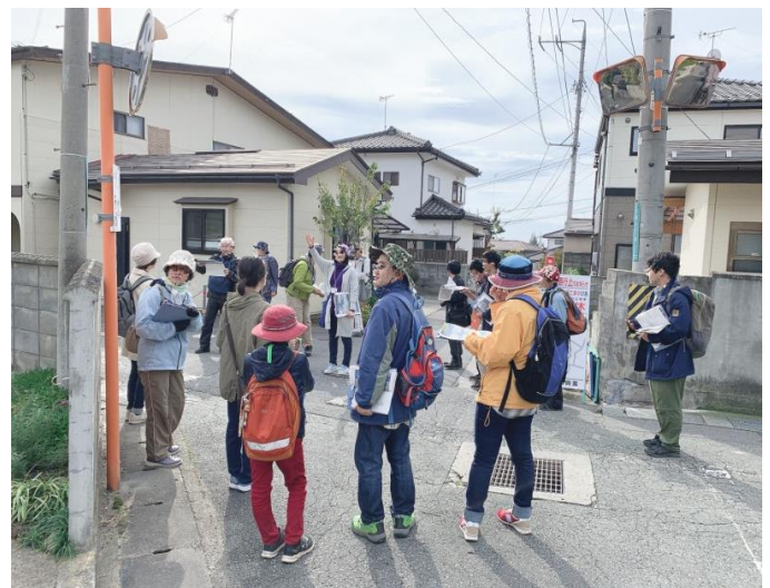
Fig. 1 The Nagano City Active Fault Walk Hosted by: The Faculty of Science, Shinshu University Location: Nagano Senior High School, around Zenkoji Temple Guided by: Students and Teachers of Nagano Senior High School